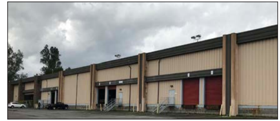
Exterior of Building