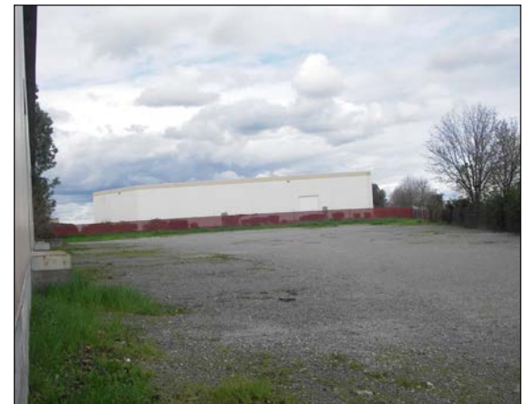
Fenced and Rocked Yard