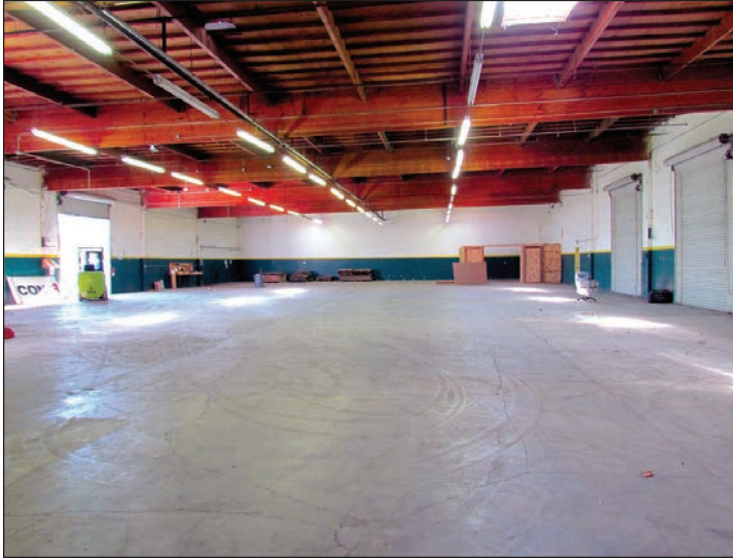
±15,547 SF of Warehouse with 6 Grade Level Doors