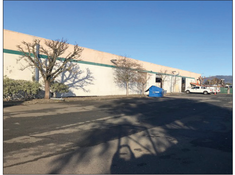
Ample Fenced & Paved Outside Storage/Staging Area